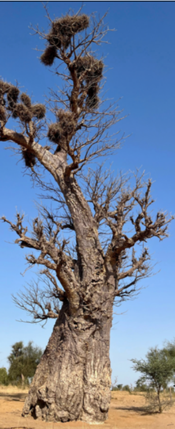
Baobab, Sahel, E. Diop. ©