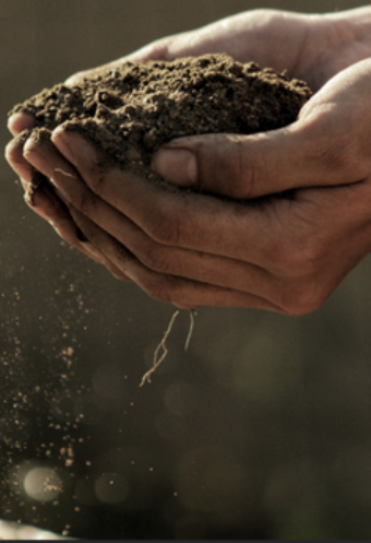
Gabriel Jimenez, 2019 ©

1. The CBD KMGBF (Dec. 2022) highlights the role of land for biodiversity, with Target 1 stressing that 'reducing threats to biodiversity' requires 'ensuring that all land and marine areas are subject to integrated spatial planning'.